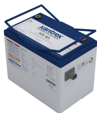
12V 105Ah XANTREX LITHIUM-ION BATTERY (883-0105-12)

OPTIMALLY CHARGED WITH THE XPLORE 120/12