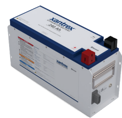
12V 240Ah XANTREX LITHIUM-ION BATTERY (883-0240-12)