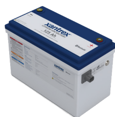
12V 125Ah XANTREX LITHIUM-ION BATTERY (883-0125-12)